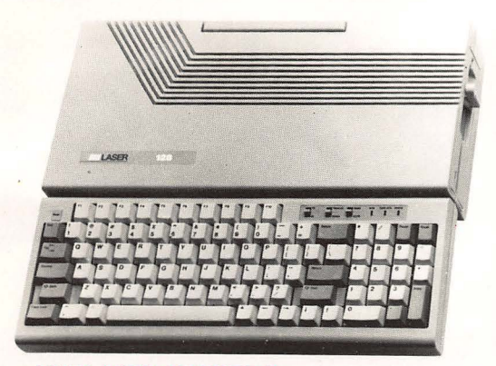
THE LASER 128 SERIES is fully expandable to grow as your requirements grow.