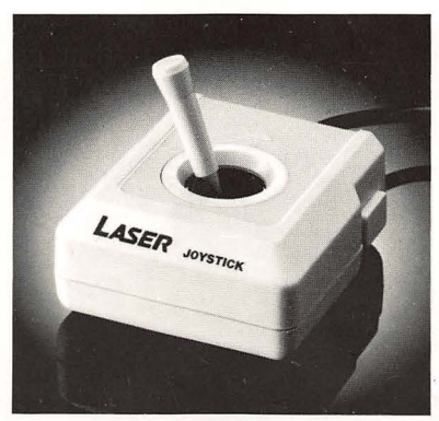
JOYSTICK for games requiring high speed hand/eye coordination.