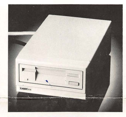
31/2" DOUBLE SIDED 800 KB DISK DRIVE