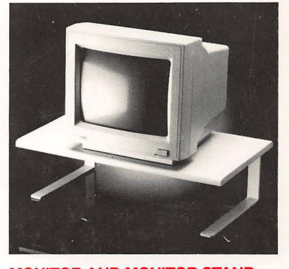
MONITOR AND MONITOR STAND for easy and convenient viewing.