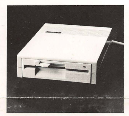
51/4" FLOPPY DRIVE 160K storage capacity