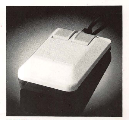
MOUSE allows interfacing without the keyboard.