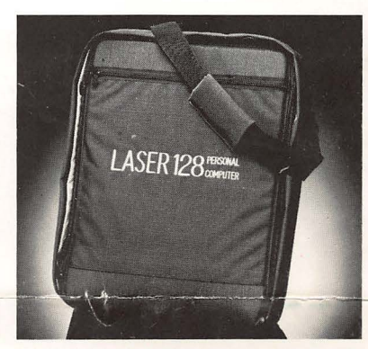
CARRYING CASE protects your computer while travelling. It's fully padded and reinforced.