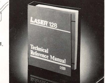
TECHNICAL REFERENCE MANUAL for advanced users.

VIDEO TECHNOLOGY COMPUTERS, INC. 400 ANTHONY TRAIL INORTHBROOK, IL 60062-2536 (312) 272-6760 TELEX: 9102220357 FAX: 312-272-1210