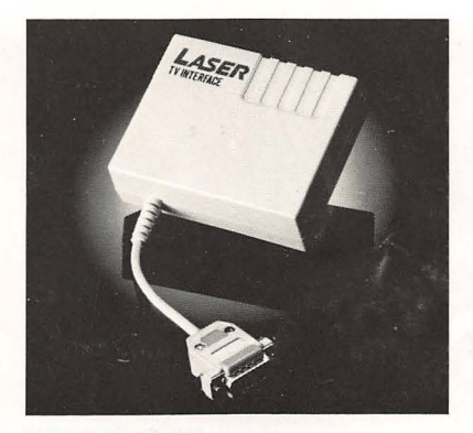
TV INTERFACE an RF modulator that permits the Laser 128 to work with any standard TV.